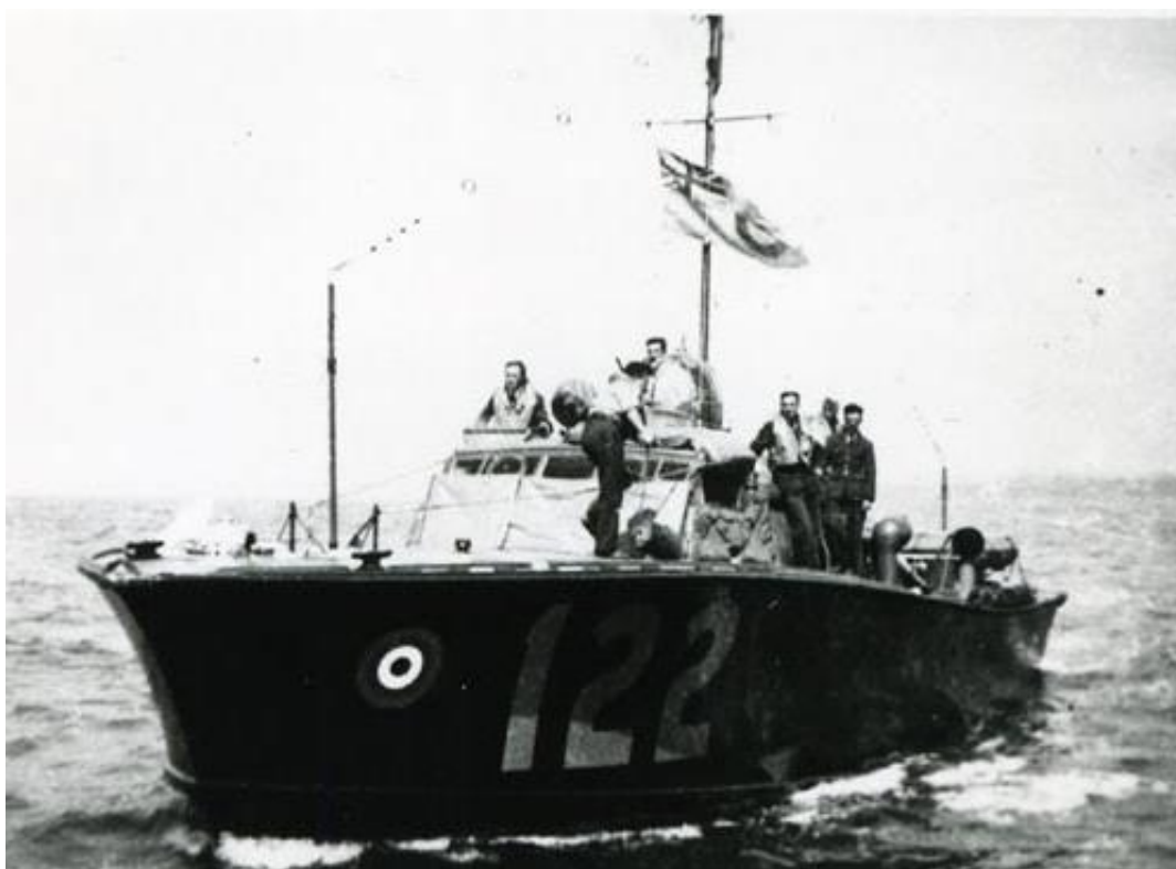
HSL 122 , a 1939 example of the "Whaleback" British Power Boats 63' Type 2 High Speed Launches. She served with No. 27 Air Sea Rescue Unit based at the Ferry Dock in Dover.