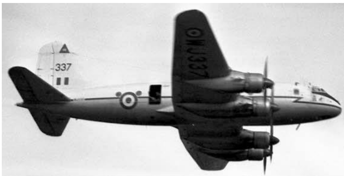
A Hastings of 48 Sqn RAF, Changi

Hastings WD497 of 48 Squadron RAF was on a routine training flight, dropping at Seletar, when it crashed near the 10th Milestone, Yio Chu Kang Road, south of Seletar at about 1430hrs. The pilot having sent a distress message. Rescue services from RAF Seletar were on the scene within a short time, but there was little that they could do. On board were eight Air Despatchers and five aircrew. All but one were dead. The living man was taken to Changi Hospital but died there. The crash was beside a kampong (village), and pieces of the aircraft hit a house narrowly missing a young boy playing there, some 30 yards from the crash. A sow and its litter of eleven piglets were killed by the crashing aircraft.